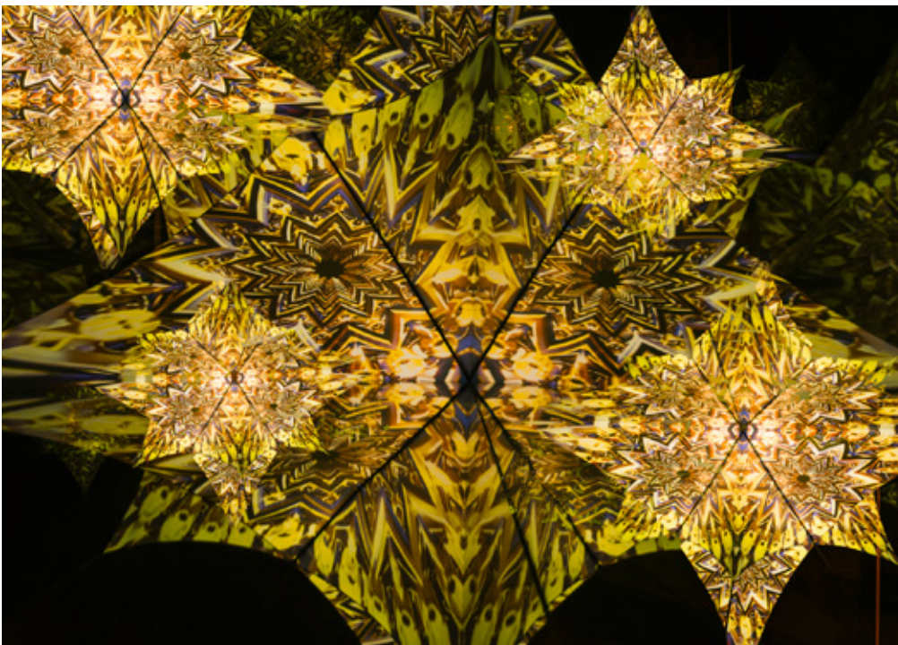
Kunstkraftwerk Leipzig Gustav Klimt - Gold Experience

Later in his career, Gustav Klimt drew inspiration from Japanism and the iconography of those Japanese painters whose decorative themes had already been introduced by Impressionist painters and Van Gogh. The installation is reminiscent of Klimt's last portraits of women, which were filled with multicolored natural and floral decorations.