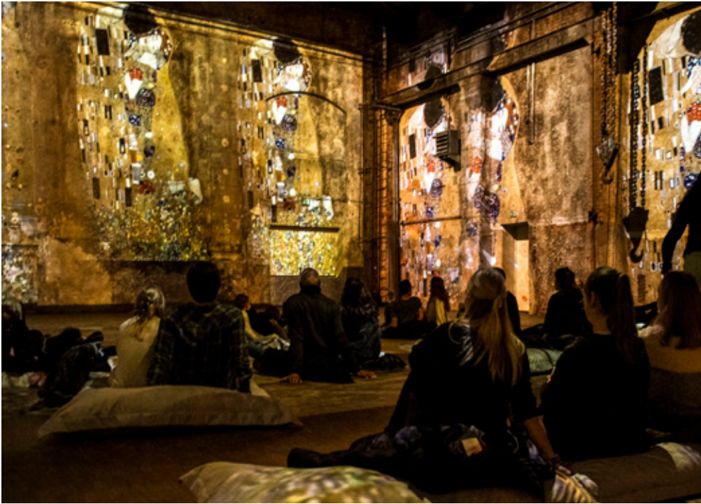
Kunstkraftwerk Leipzig Gustav Klimt - Gold Experience Immersive show

In the “Gold Experience”, the audience moves between large rooms that can be experienced, multimedia installations, mirrored rooms, light sculptures, decorations and magnificent ornaments from the imperial era. The Italian creative studio created these immersive spaces, taking inspiration from the revolutionary artist’s ‘golden age’. The exhibition is a great opportunity to learn more about the artist who marked the beginning of modern painting at the end of the 19th century and gave a new face to the culture of his time.