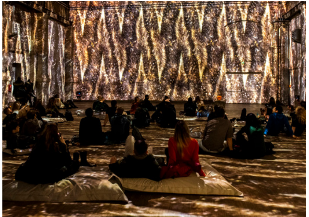
Kunstkraftwerk Leipzig Gustav Klimt - Gold Experience Immersive show

Divided into several themed areas, the exhibition pays tribute to Klimt's history and artistic career with immersive shows and installations inspired by his most famous works and spectacular painting techniques. The public experiences the exhibition as a course.